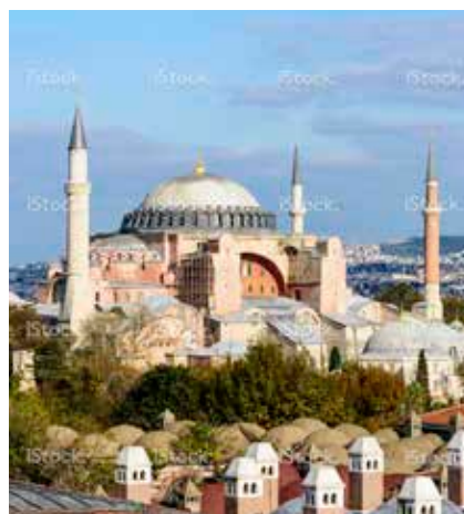
PERA PALACE JUMEIRAH (3)